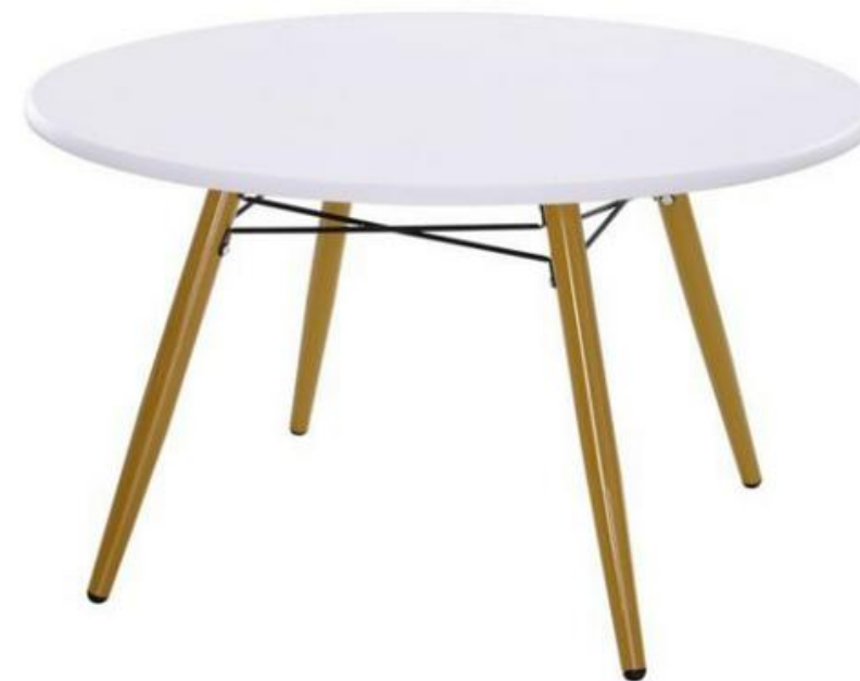
TA21 - COFFEE TABLE