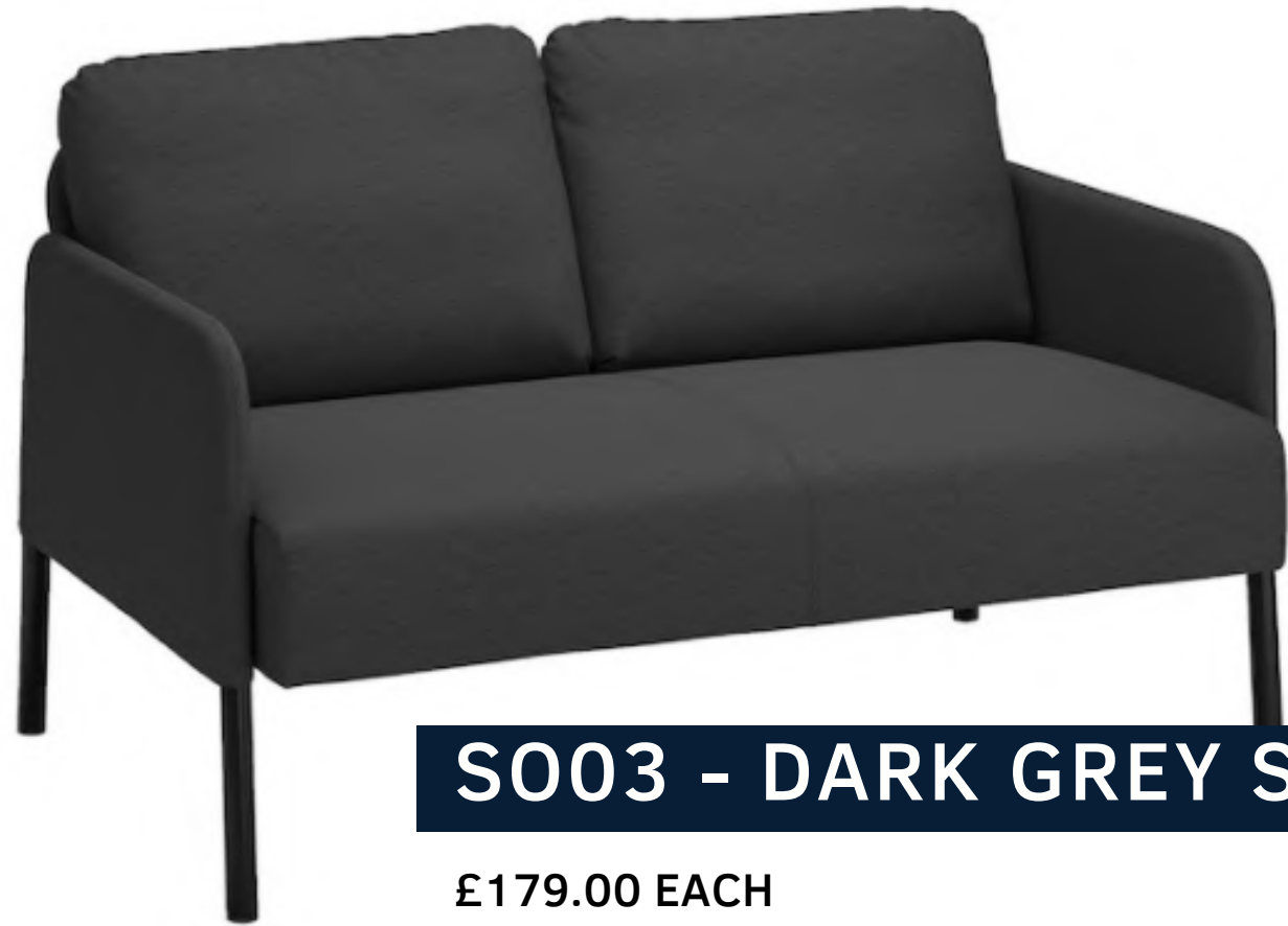
S003 - DARK GREY SOFA