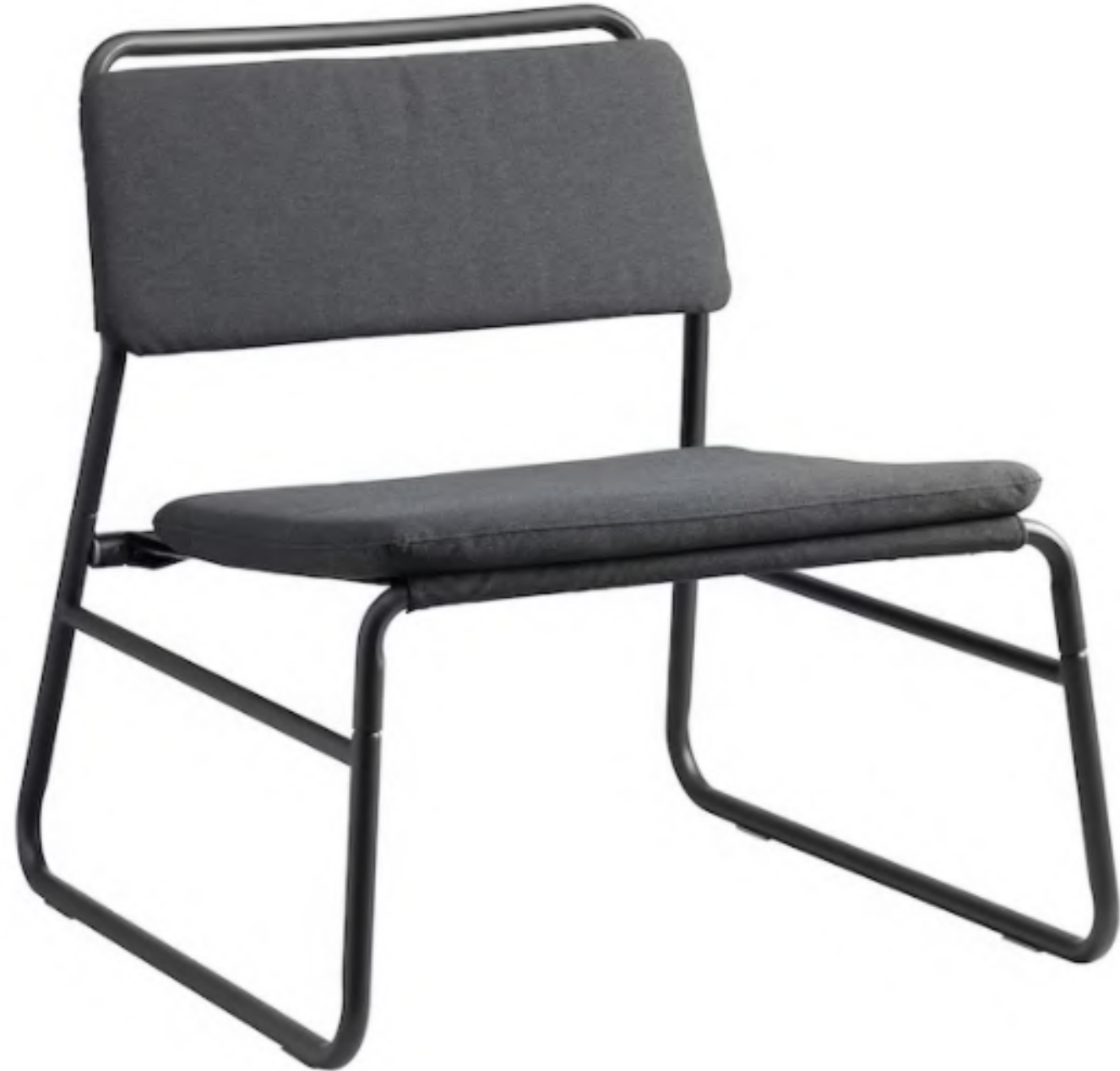
L010 - LOUNGE CHAIR