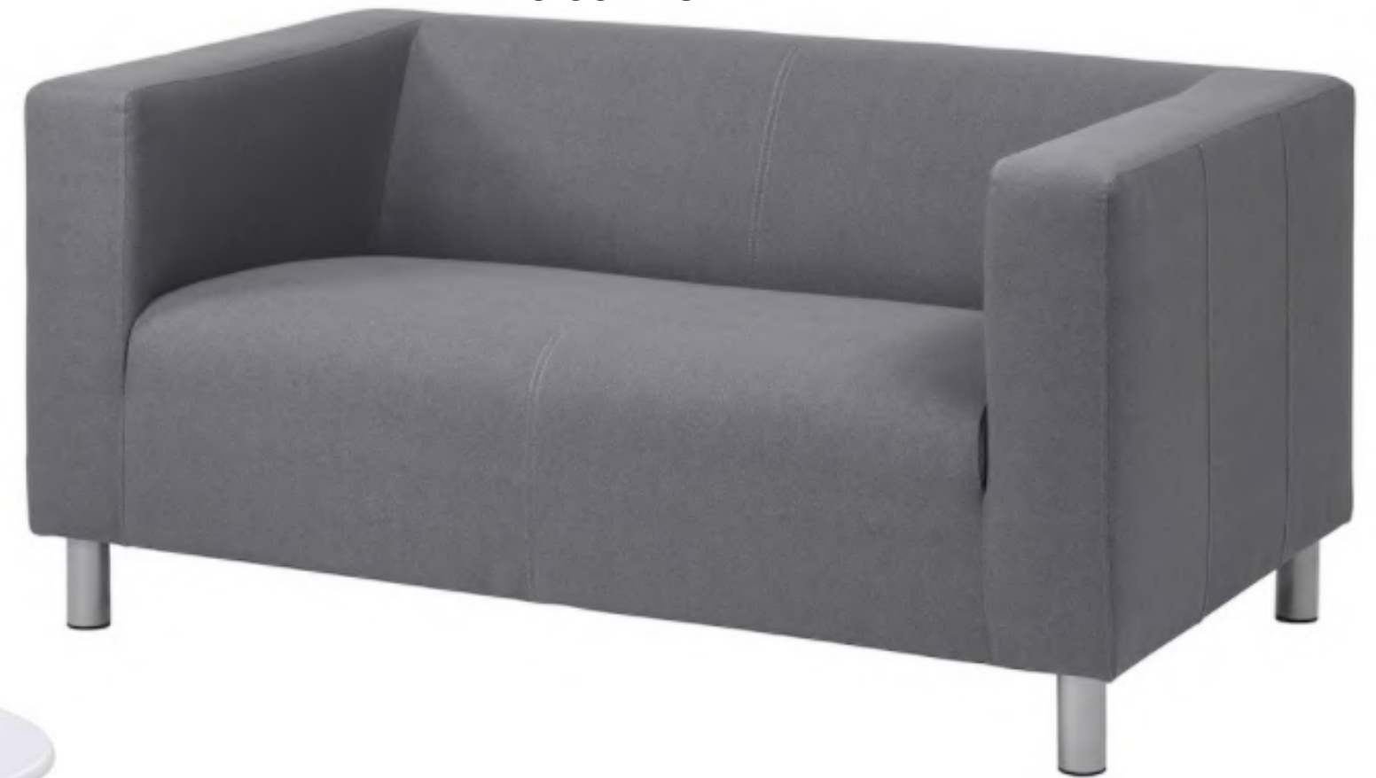
S009 - MID GREY SOFA