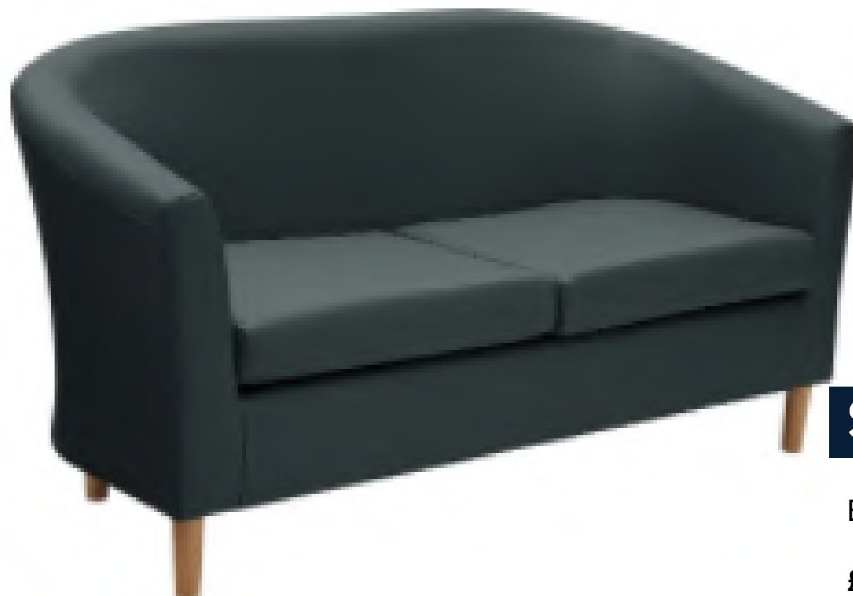
S005 - BLACK TUB SOFA